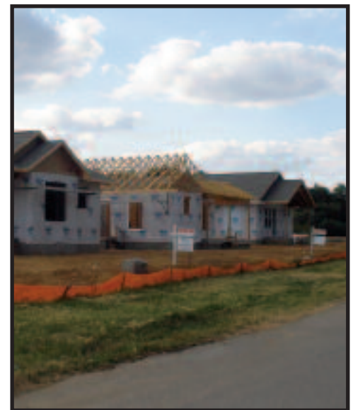
Homes started going up in Shadewood Place in June and are expected to be completed sometime next year. When finished, there will be 19 Habitat homes and up to four market-rate homes built by Bussing Construction.