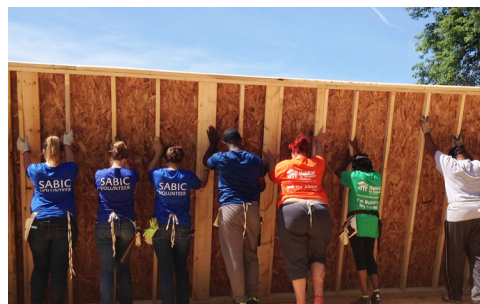
Volunteers, Core Crew members, and future homeowners work together to raise the walls of a new Habitat home.