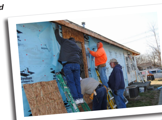
Core Crew doing preliminary work at 1427 Florence Street in February