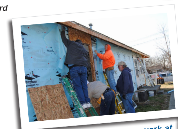
Core Crew doing preliminary work at 1427 Florence Street in February