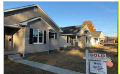
Habitat homes on West Virginia Street show the revitalization of a neighborhood.